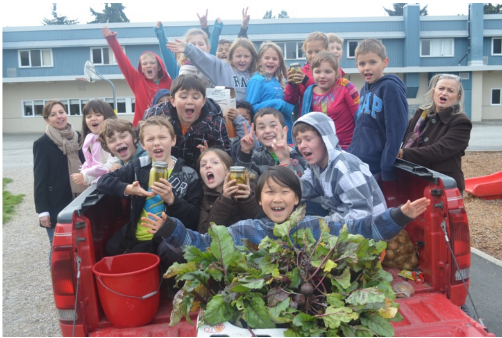
Project Pickle Spring 2014

Keeping kids fingers dirty in the Delta School District.