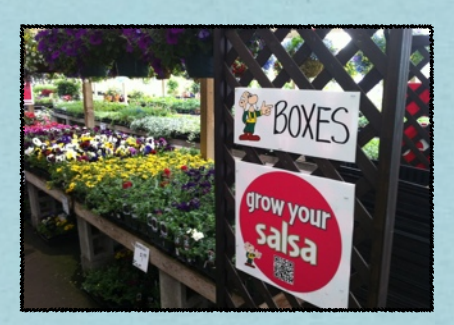
HARRIS NURSERYLAND We support backyard horticulture and have everything you need to grow great veggies, fruits and flowers. Have fun growing, sharing and trading!