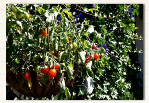
"children need more exposure to horticulture and farming to ensure there is a steady supply of bodies to work the land."